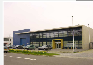
Eindhoven Holding Headquarters and International Development Center