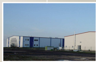
Sárbogárd Metal, Plastic and Assembly