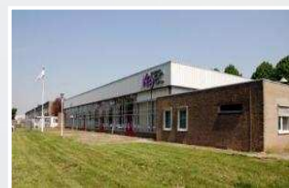
Sittard Metal, Plastic and Assembly