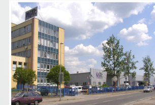
České Budejovice Metal, Painting and Assembly