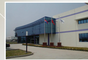
Suzhou PC Metal, Plastic, Painting Suzhou MM Assembly